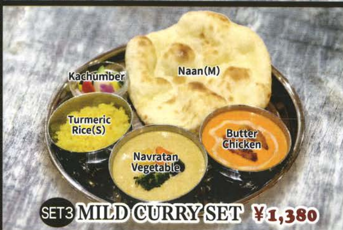
SET 3 MILD CURRY SET ¥ 1,380