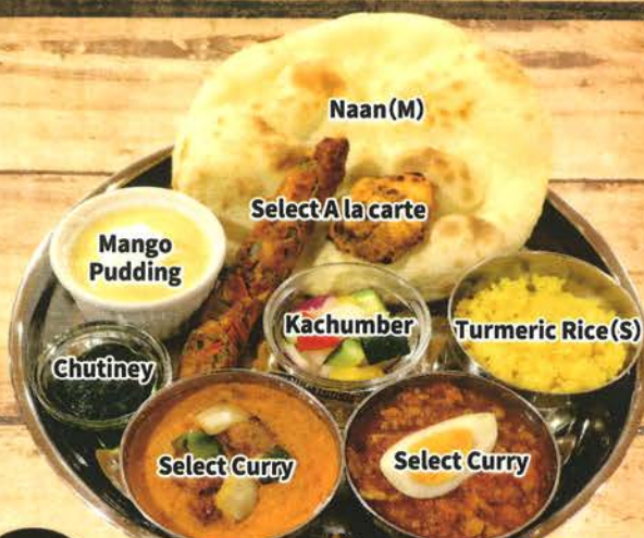
SET 10 OTONA KIDS SET ¥ 1,980