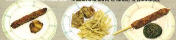
ST Tandoori(2kinds) SF Fried(2kinds) SG Grill(2kinds)

※Please choose from SET10 a la carte selections here. ※Each a la carte (2 kinds) is whimsical.