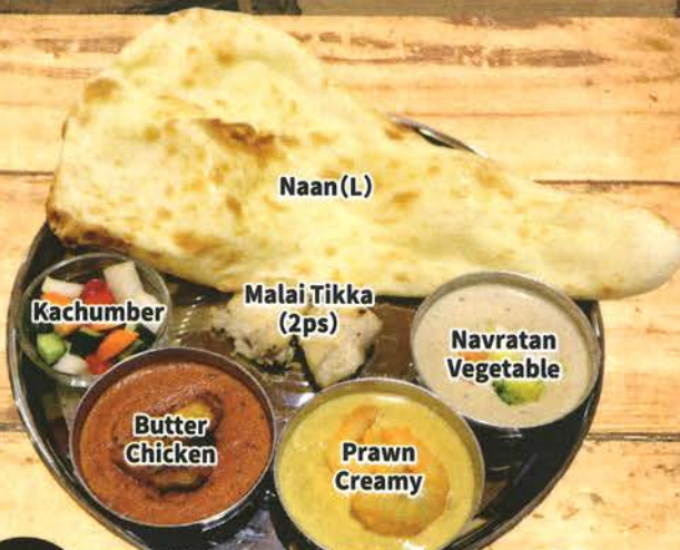
SET 9 DELUXE MILD SET ¥ 1,980