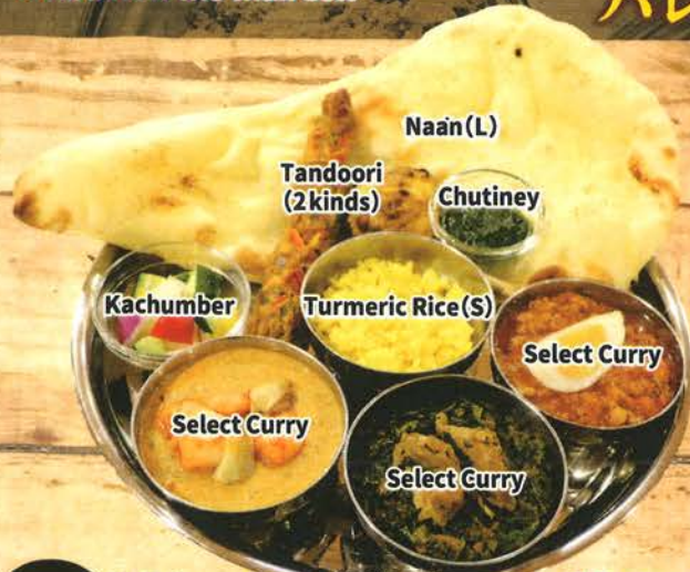
SET 7 MAHARAJA SET ¥ 2,180

※Tandoori (2 kinds) are whimsical. ※Photo is image. ※Prices include tax.