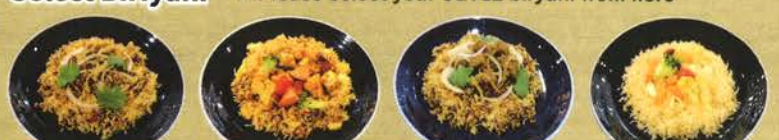
R11 CHICKEN BIRIYANI R13 VEGETABLE BIRIYANI R15 PORK BIRIYANI R17 NAVRATAN PILAU

※Please select your SET12 biryani from here