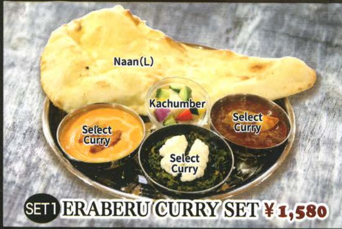
SET 1 ERABERU CURRY SET ¥ 1,580

※Please choose your curry from below. ※Photo is image. ※Prices include tax.