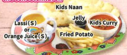
K1 NAAN KIDS SET ¥ 680