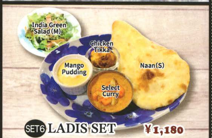
SET 6 LADIS SET ¥ 1,180

SELECT CURRY For more details on curry, please see the single curry page.