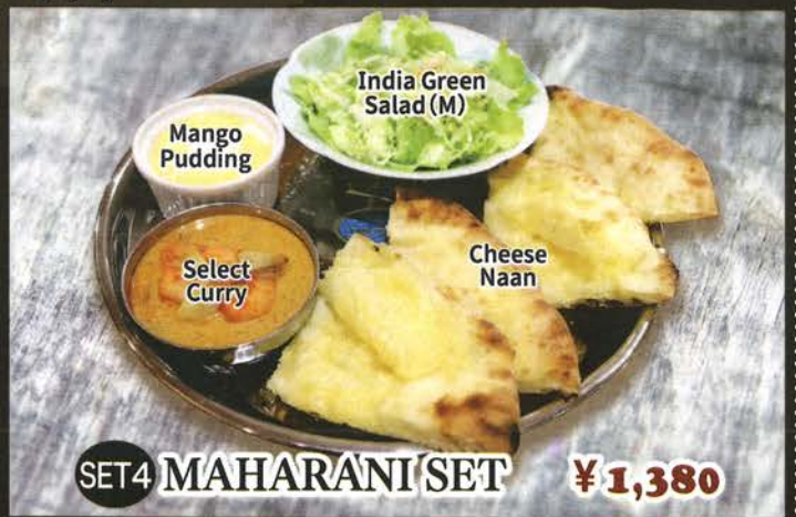
SET 4 MAHARANI SET ¥ 1,380