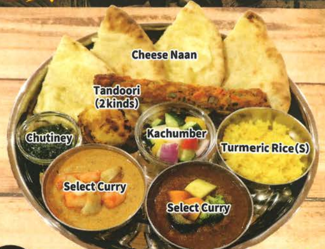
SET 8 DELUXE CHEESE NAAN SET ¥ 1,980