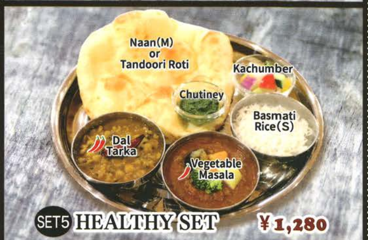
SET 5 HEALTHY SET ¥ 1,280